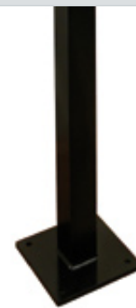
Pedestal, Part-No. 531P101045