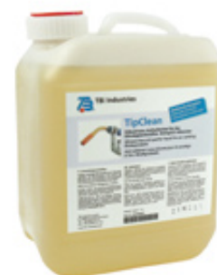
Anti-spatter fluid Tbi TipClean, 5 liters Part-No. 392P00007